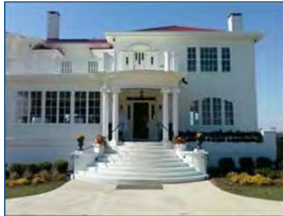
Historic Obici House