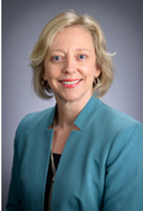
From the President IFMA Hampton Roads Chapter